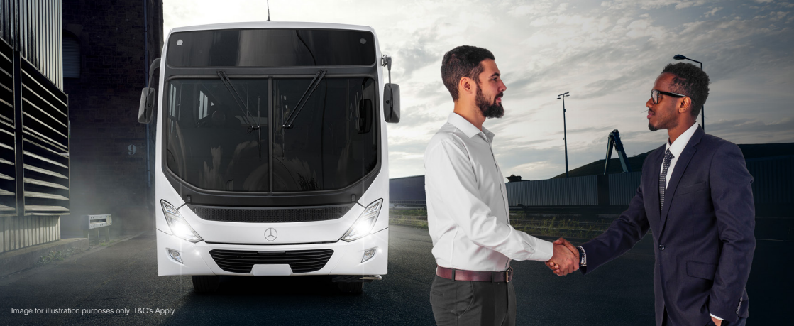
Image for illustration purposes only. T&C's Apply.